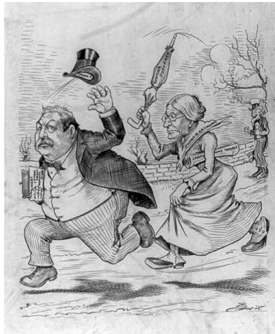
Credit: cartoon showing President Grover Cleveland with book, "What I know about women's clubs," being chased by Susan B. Anthony as Uncle Sam laughs in the background, 1892-1896. Reproduction no. LC-USZ62-96565.

The sacrifices these three made to win the right to vote for women is amazing and one that few people recognize today. In most cases, they gave their lives to the movement. Becoming public advocates at the time for this or any movement, meant that they were living lives and playing roles in a totally unconventional, unacceptable, inappropriate manner. To many they were pariahs. It is impossible to even conceive of how difficult their lives were, what hardships they endured – public humiliation, terms in jail, ridicule – and they did it so that the women of yesterday, today and tomorrow can exercise their right to vote.